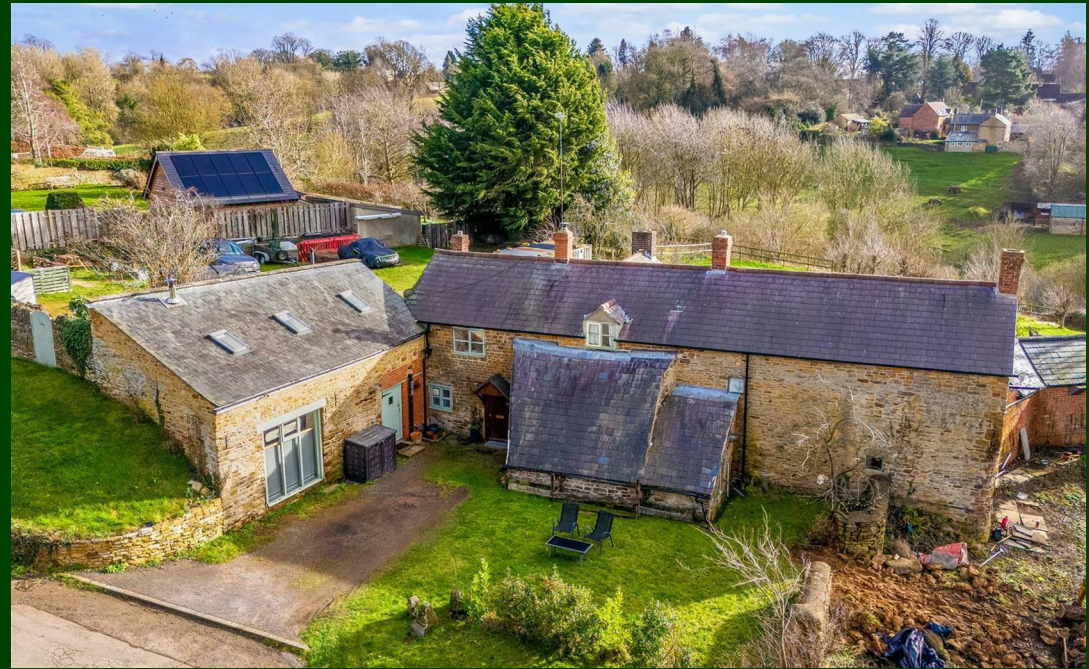
1 Church Street Charlbury Oxfordshire OX7 3PW Telephone: 01608 811146